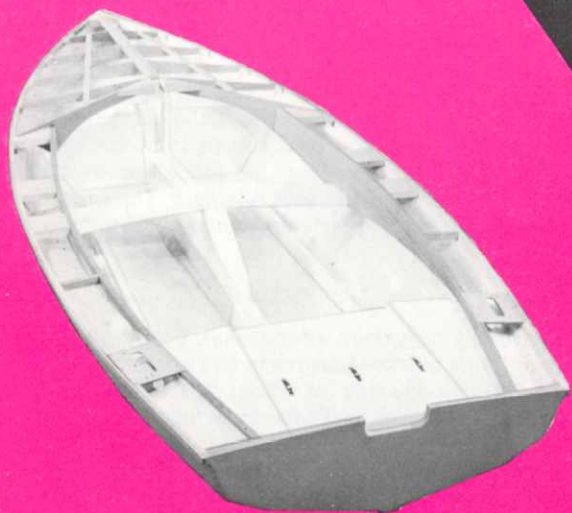
The Mark II Composite WAYFARER Stage II Hull

As you can see you get full value for money from "Moares"