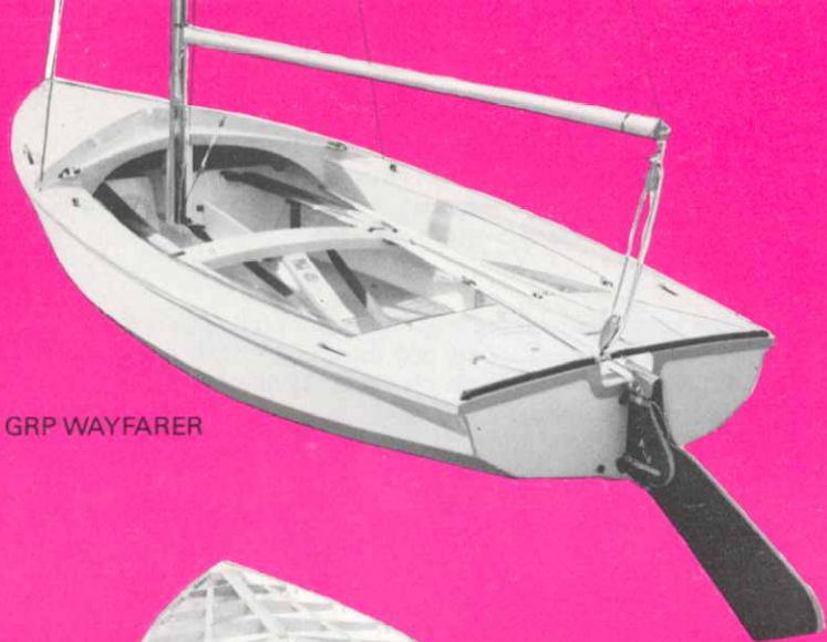
The Mark II all GRP WAYFARER